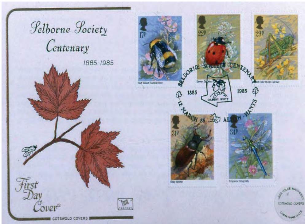
Fig 5. The Selborne Society's Centenary Cover (1985)