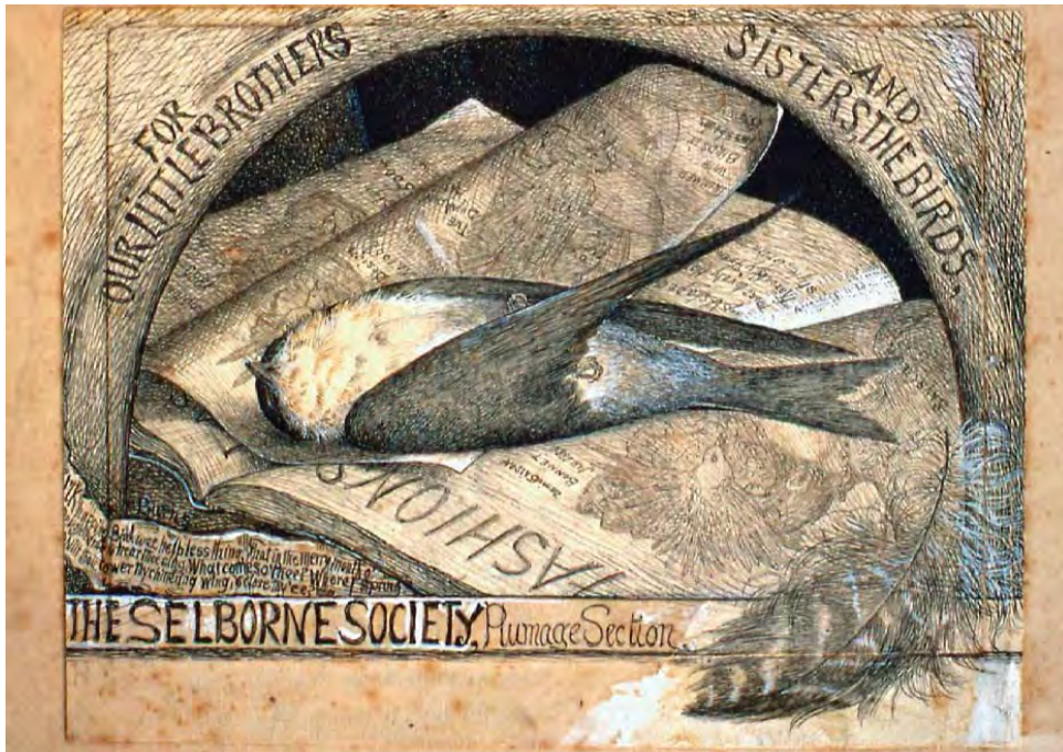
Fig 2. The Plumage Section's Crest